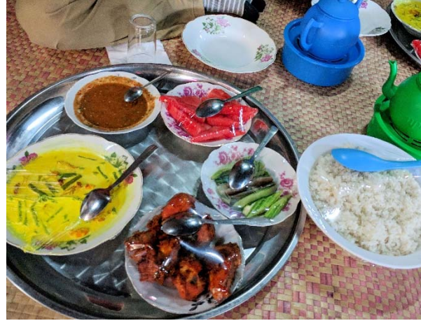
Traditional Malay cuisine