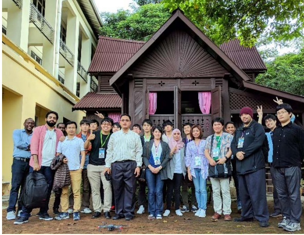
Traditional Malaysian house

After arrived at UPM, the campus tour was conducted. The school bus took us to a variety of facilities in UPM including UPM museum. There are some traditional Malaysian houses in the campus where participants can eat traditional Malay cuisine in a finger food manner.