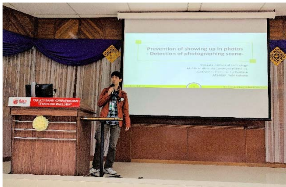
Presentation in research workshop (1)

The research workshop was also one of the main activities in this program. The participants introduced their own current research themes, stating the achievement and the remaining issues which may lead to the collaborative research.