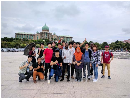
Putra Mosque visit

Putra Mosque visit and MJIIT (Malaysia - Japan International Institute of Technology) visit were involved in the program as cultural exchange.