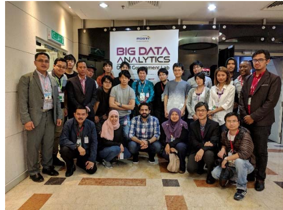
MIMOS visit (2)