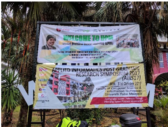
Banner for this gPBL

The opening ceremony took place in the main lecture hall of Faculty of Computer Science and Information Technology. Subsequently, the welcome party was held with surprising cakes and traditional Malaysian foods that celebrated this gPBL.