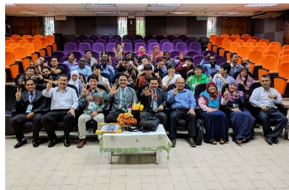
Group photo after the closing ceremony