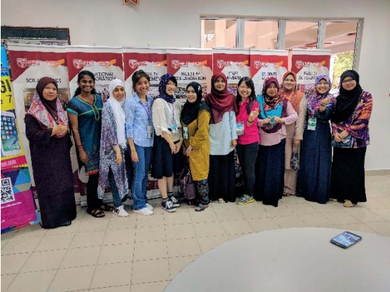
Females commemorative photo

Subsequently to the closing ceremony, the farewell party was held.