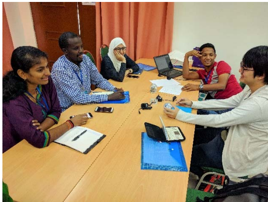
Discussion in gPBL

Global PBL on Ubiquitous Computing and Information Network was conducted. PBL stands for Problem Based Learning where a problem is given and the participants propose the solution in a group discussion manner. In this PBL, however, the problem was not given. The participants had to find the problem itself by themselves. That is why this gPBL is called AgPBL (Advanced gPBL). The participants were divided into eight groups. Four research topics, which are Big Data, Image processing, Security and Robot programming, were prepared for discussion. One topic was assigned to each group. Each group investigated the topic: finding issues, proposing the solutions, discussing the novelties and effectiveness. Finally, each group made a presentation about the idea and discussed it with the audience including the other group members and the faculty members.