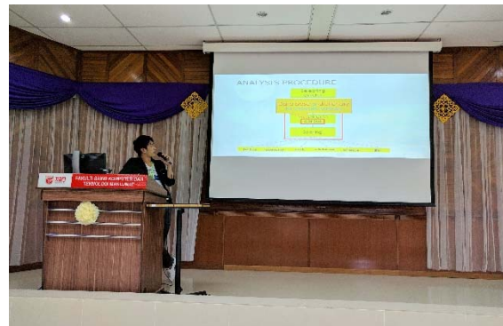
Presentation in research workshop (2)