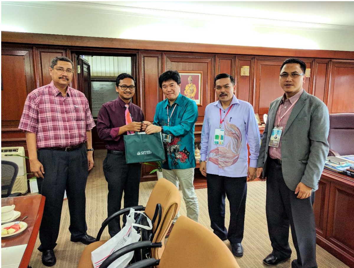
Meeting with Deputy Vice Chancellor