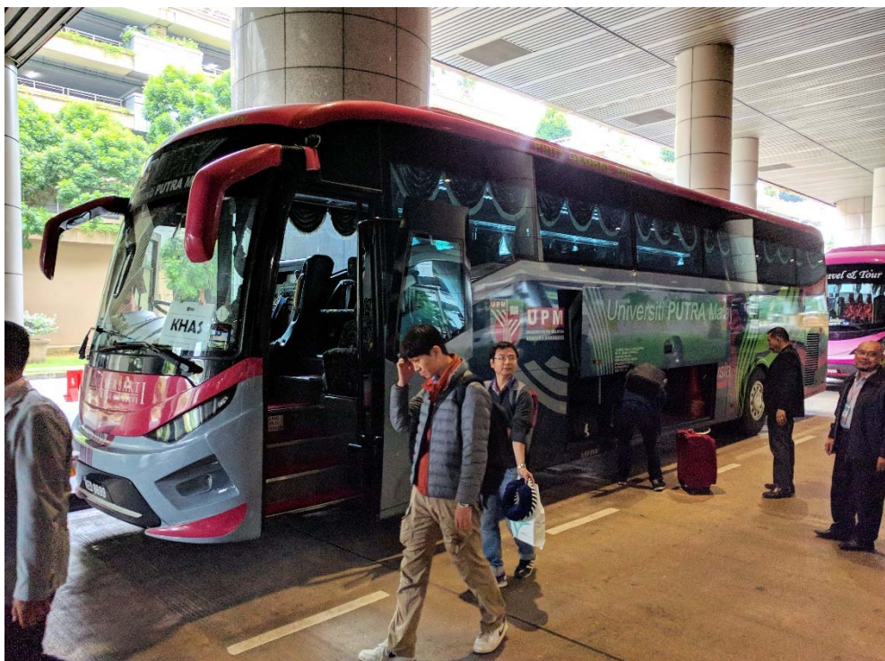
Transportation by UPM bus