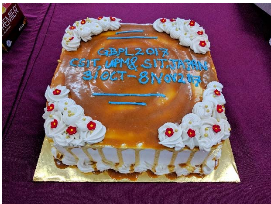
Surprising cake celebrating the gPBL