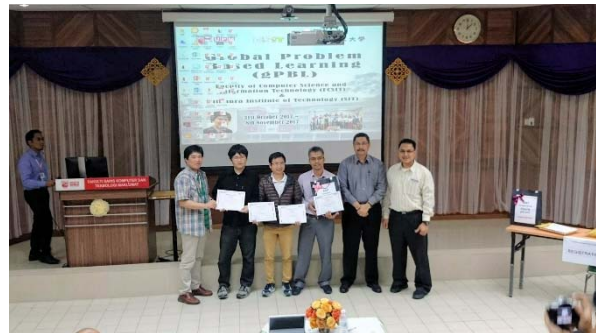
Best presentation award