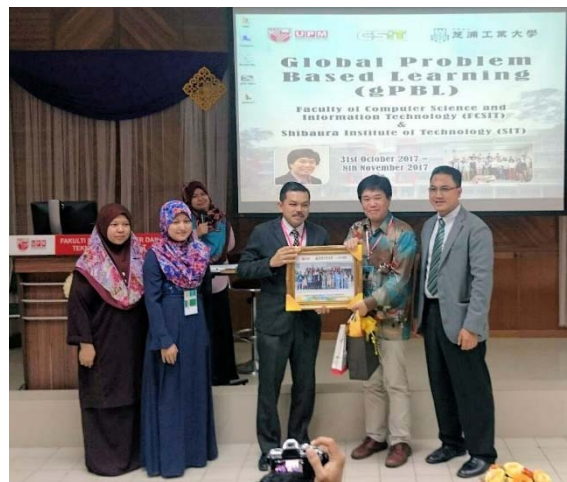
Special gift 1 from UPM