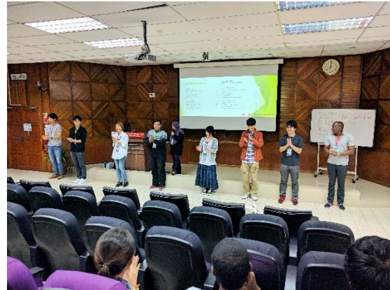
Ice breaking (2)