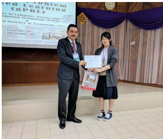
Certificate of completion

On the final day, the closing ceremony took place in the main lecture hall of Faculty of Computer Science and Information Technology. The certificate of completion for the gPBL was given to each participant. Also some special gifts were provided to SIT.