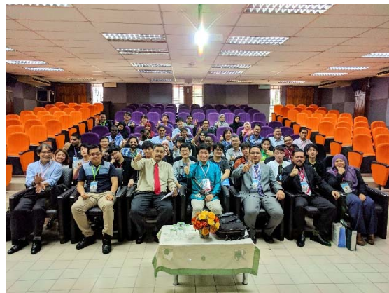
Group photo after the opening ceremony