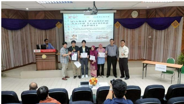
Best proposal award