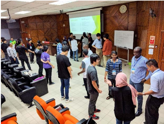
Ice breaking (1)

After the opening ceremony, the ice breaking was conducted to get acquaintance with each other although they had already enjoyed talking.