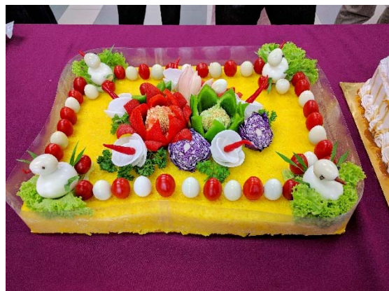
Traditional Malaysian food