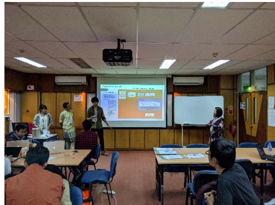
Presentation in gPBL