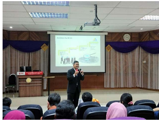
Invited lecture “The challenge of security enforcement in IoT era”