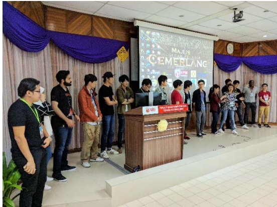
Introduction of SIT