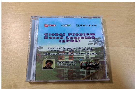
Special gift 2 from UPM