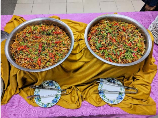
Farewell party with Mee goreng