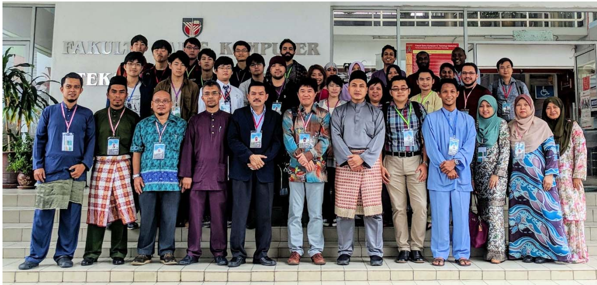
Group photo in front of Faculty of Computer Science and Information Technology