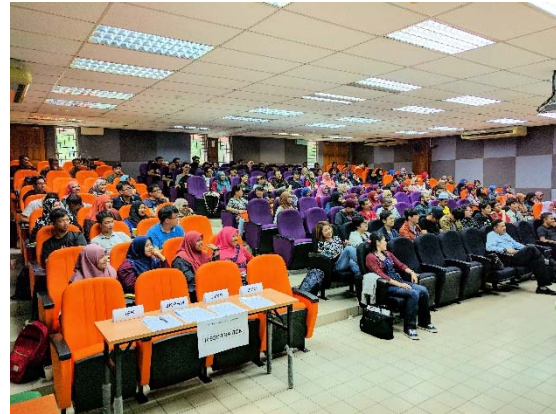
More than 100 participants